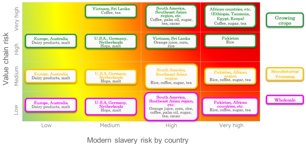
11 major items procured by the Asahi Group Results of theoretical analysis of modern slavery risk

Even when growing the same crops, the level of modern slavery risk differed according to the country or region.